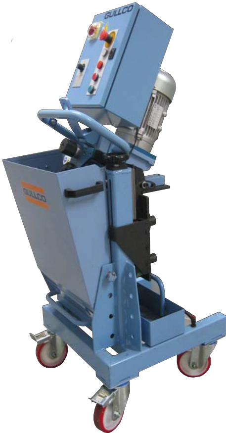
PLATE EDGE BEVELLING MACHINE - KBM®50

Adjustable bevel angle between 15° - 60°